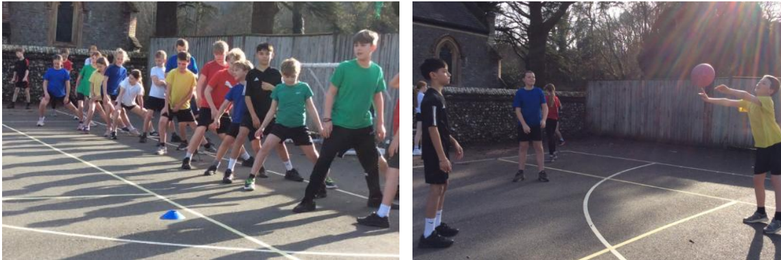
Red Kites enjoying PE in the sunshine this week as they launched their new netball unit.