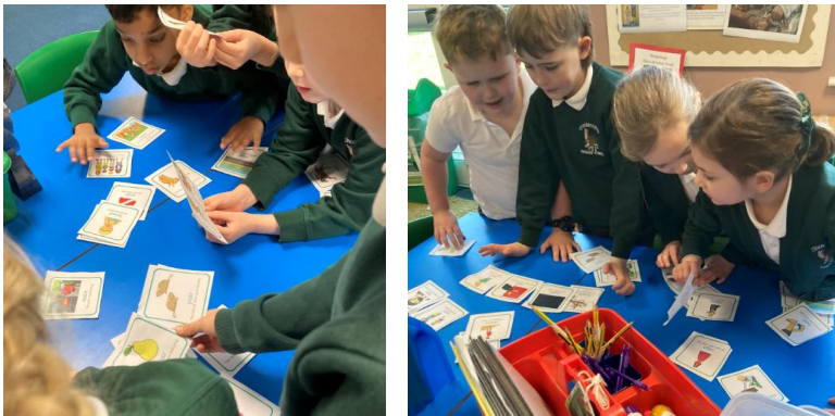
Hedgehog Class have been matching homophones.