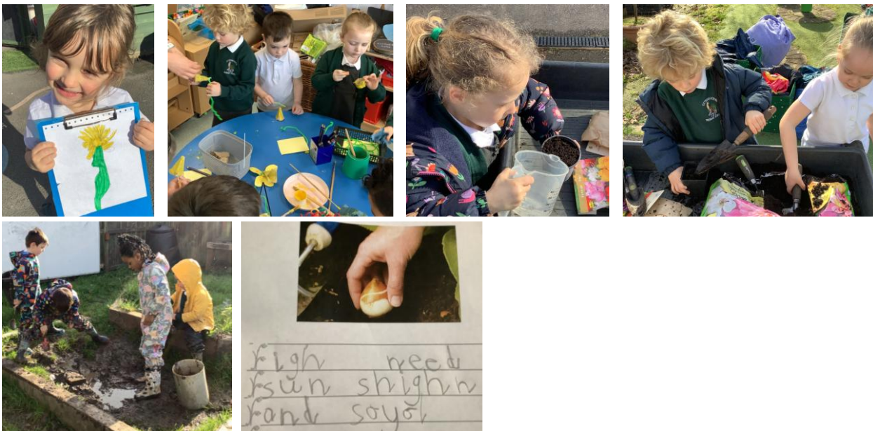
Otters have been embracing spring this week as they have read, 'That's not a daffodil, that's a...'

They have been planting summer bulbs, hunting for daffodils in the school grounds and learning how to draw them and make their own. They've also been enhancing their learning through digging in their mud kitchen.