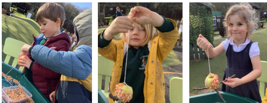
Children in our Otter Class have been making bird feeders this week to encourage birds into their garden...