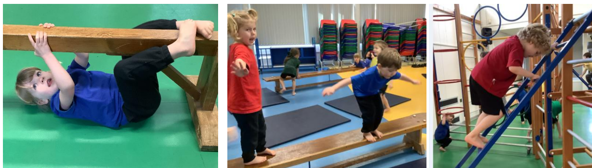
...and they have also been exploring ways to move and balance on the equipment in the hall.