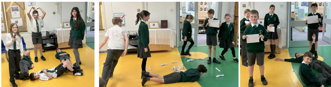
Exploring circuits in Kestrels Class.