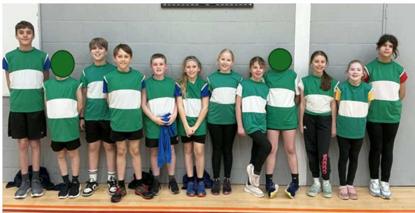
Year 5/6 children representing the school at the Sports Hall Athletics