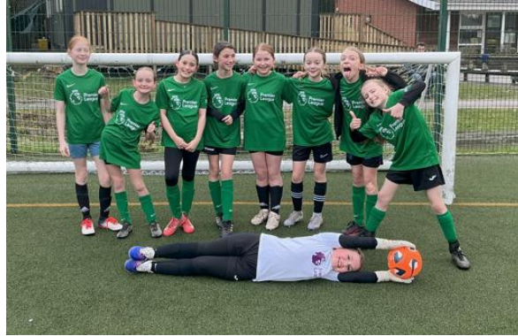
Our girls' football team playing Knightwood Primary School this week.