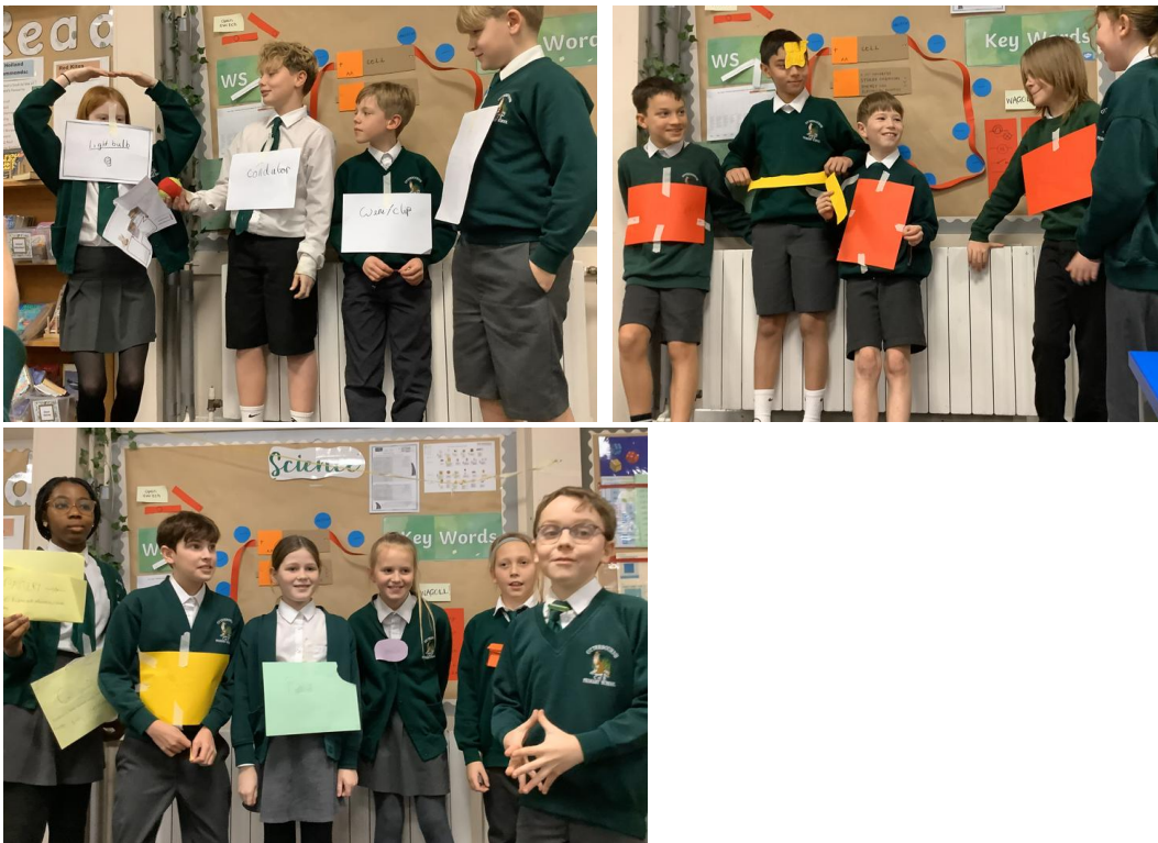
Year 5/6 children have been dramatising electrical circuits.