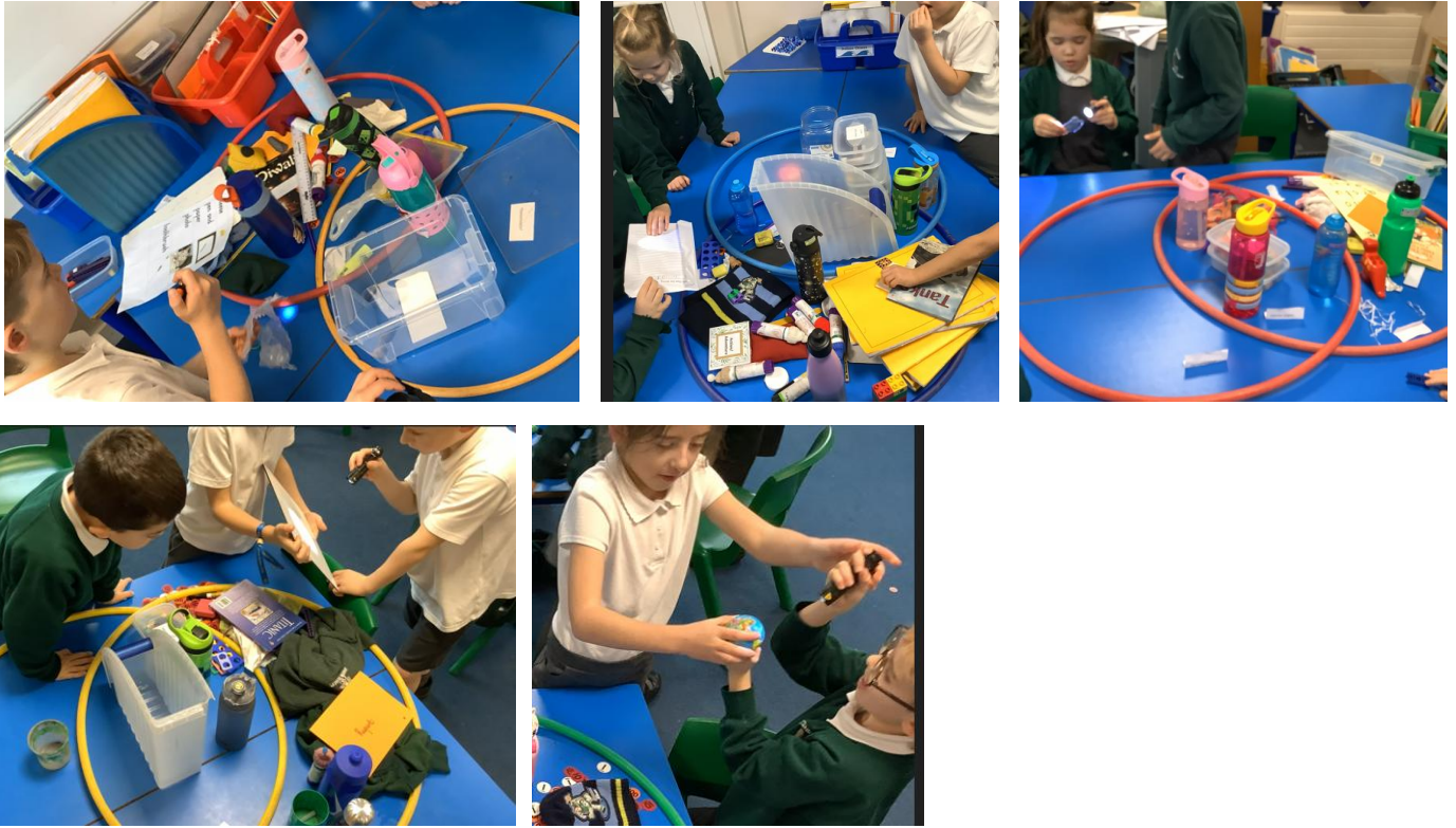
Year 2 children have been using a torch to help them sort objects into transparent, translucent or opaque.