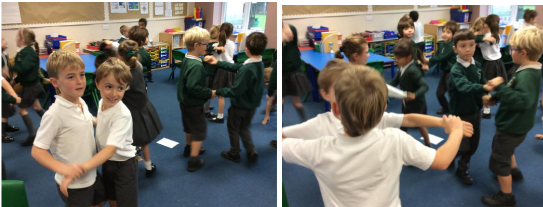
Hedgehogs Class competed in their own Strictly Come Dancing after being inspired by the story Giraffes Can't Dance.