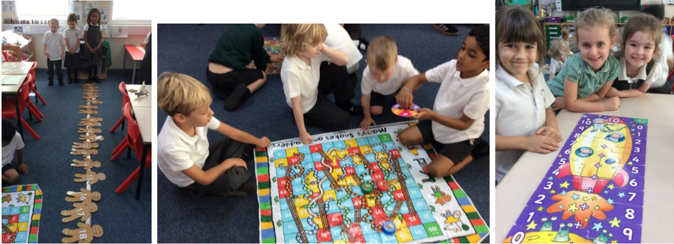
Squirrels class have been busy playing lots of counting games.