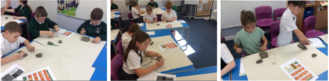
Year 3/4 making Pictish stones