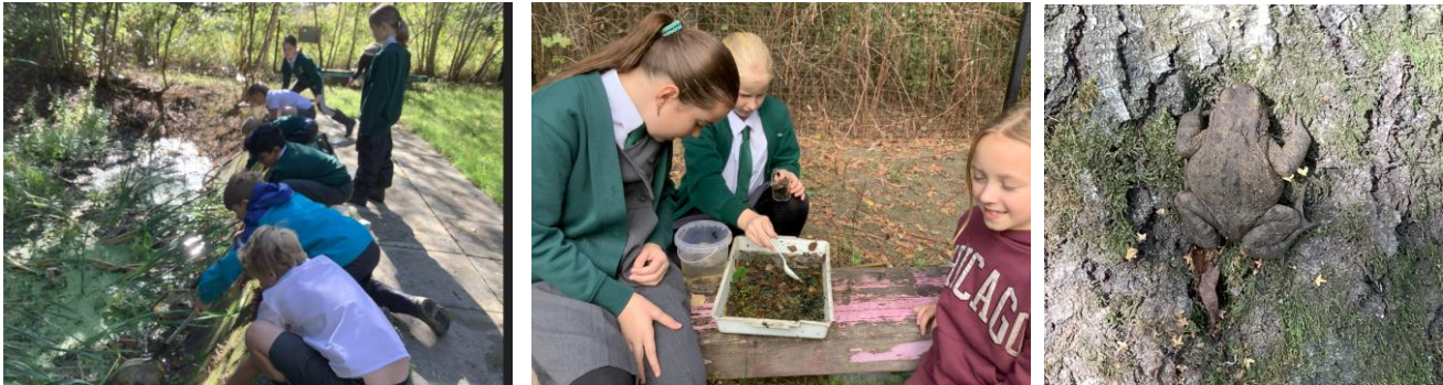
Year 5 surveying the species in our very low pond and woodland. They were delighted to find this tree-climbing toad!