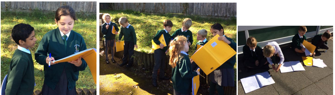
Year 3/4 reading aloud and editing their Barnabus creature non-chronological reports.