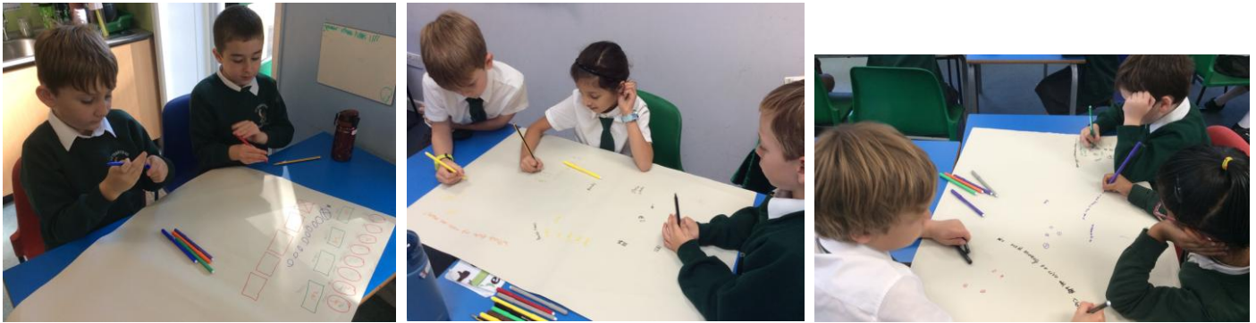
Year 3 recalling their existing knowledge about money