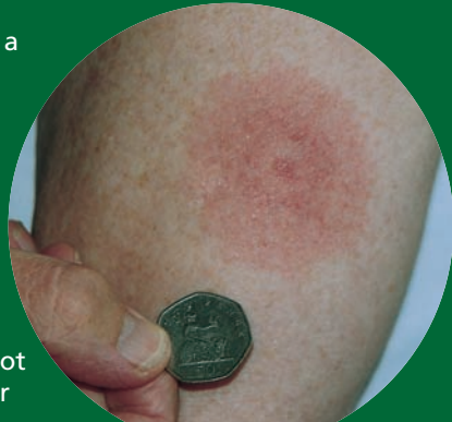
Typical early symptom of Lyme disease: gradually spreading pink rash (erythema migrans) around the site of bite (photo: 7 days after bite)

The first sign is often a pink or red rash (erythema migrans) around the site of the bite. It can gradually spread to form a large circle or patch up to 50-75 centimetres (20-30 inches) diameter if left untreated. It is not usually raised, itchy or painful and clears up rapidly with antibiotic treatment.