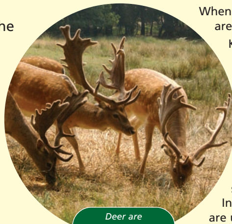
Deer are important carriers of ticks

Lyme disease, also called Lyme borreliosis, is an illness caused by the bacterium Borrelia burgdorferi , which lives in the gut of some ticks. Most ticks do not carry the bacteria, but infection could be passed on to people bitten by infected ticks. To be safe you should assume that any tick bite is potentially infectious. Infected ticks are found in many parts of the country, including the New Forest, East Anglia, West Country, English and Welsh Uplands and the Scottish Highlands. They also occur in other parts of Europe and North America.