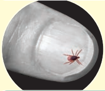
Adult on thumbnail - actual size