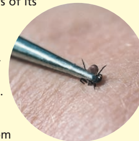
Follow manufacturers instructions when using tick extractors.

If you are concerned in any way or become unwell, see your doctor as soon as possible.