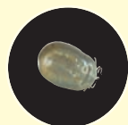
Engorged adult female tick after feeding - actual size